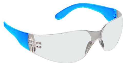
VENUS E-102 Size: Regular