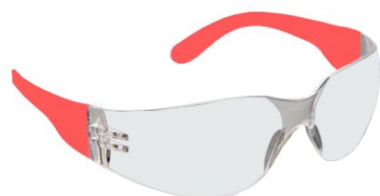
VENUS E-102S Size: Small

11095 CLEAR CHC BLUE Above Packing: Pack of 20