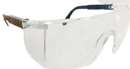
VENUS E-101 Sliding Temple